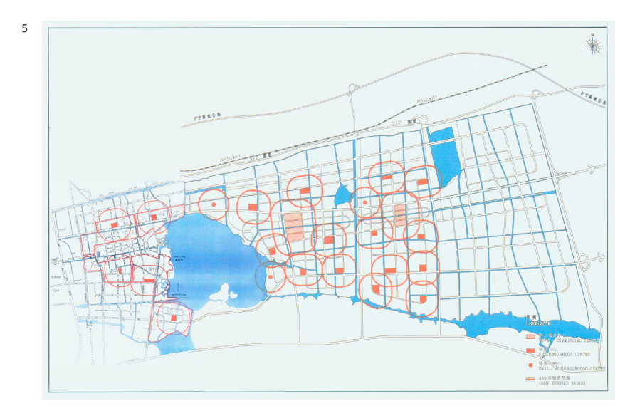
Figure 5: Caption: Diagram of neighborhood units in SIP.

Urban planning and design played a significant role in SIP's economic accomplishments. Moving away from traditional types of economic development zones or high-tech industrial parks in China, SIP was designed as a balanced and self-contained city from the beginning. The plan referred back to Ebenezer Howard's